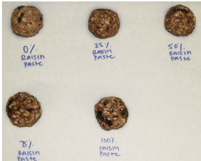
Uncooked Dough: 45g portions