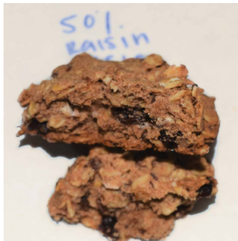
50% Raisin Paste Crumb